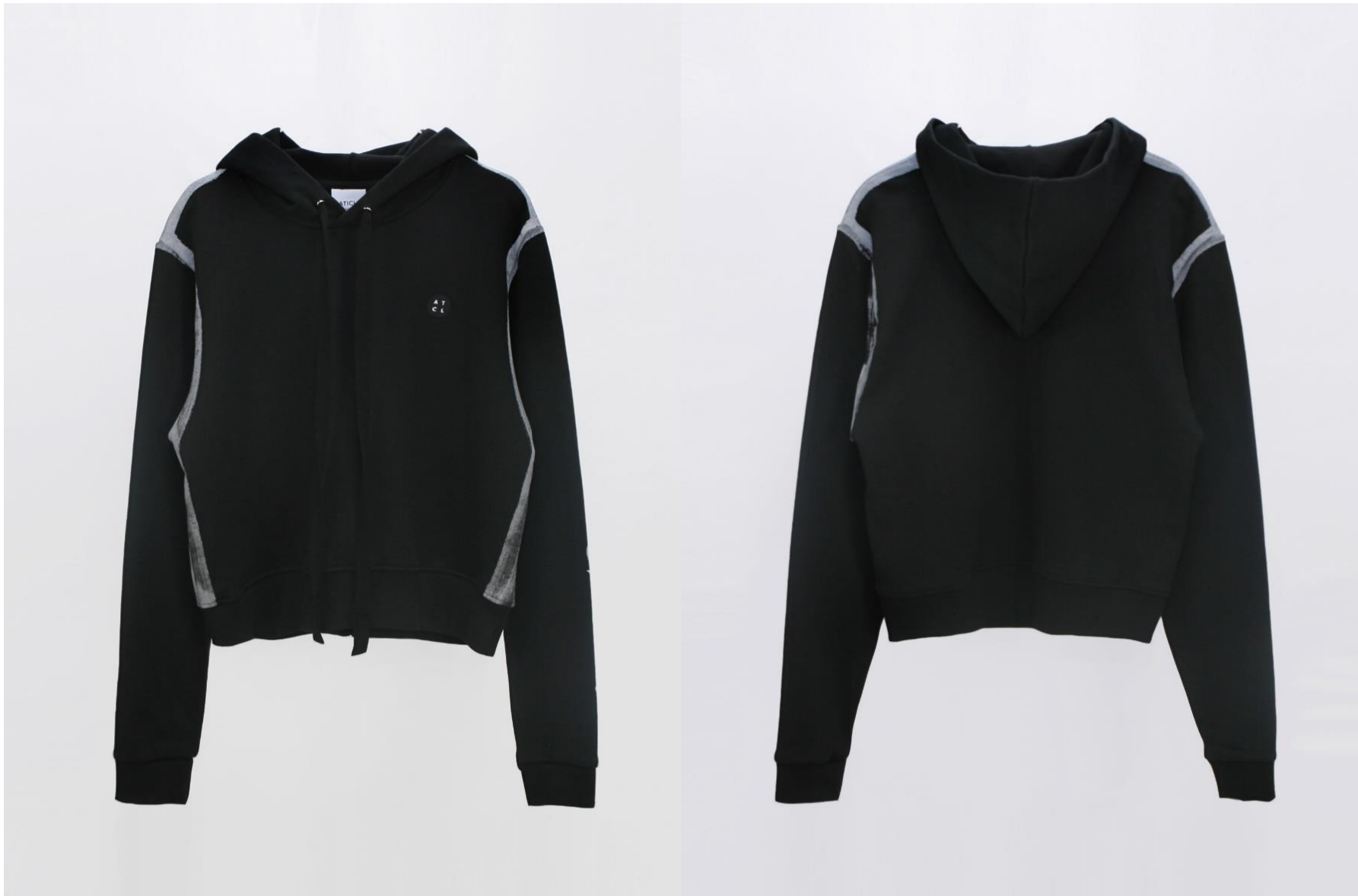
Line drawing Print Hoodie Sweatshirt (Black)