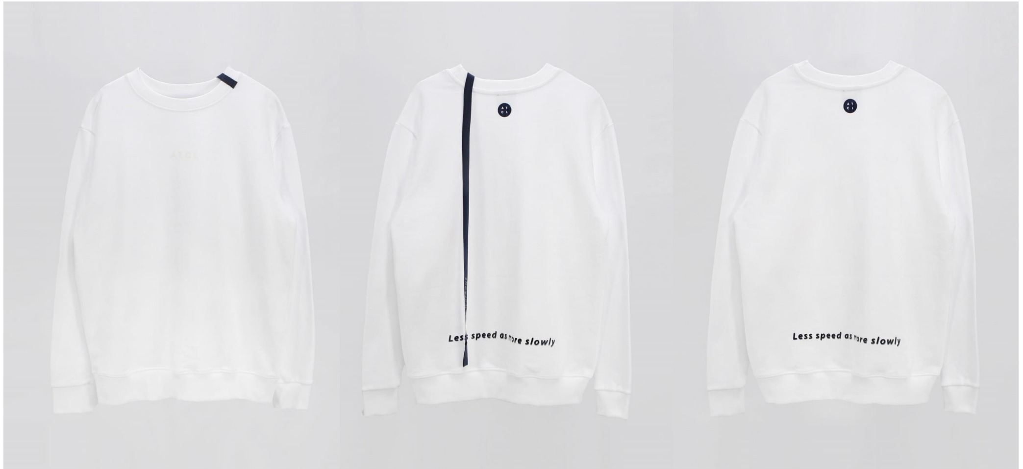
Ribbon point Basic Sweatshirt (White)