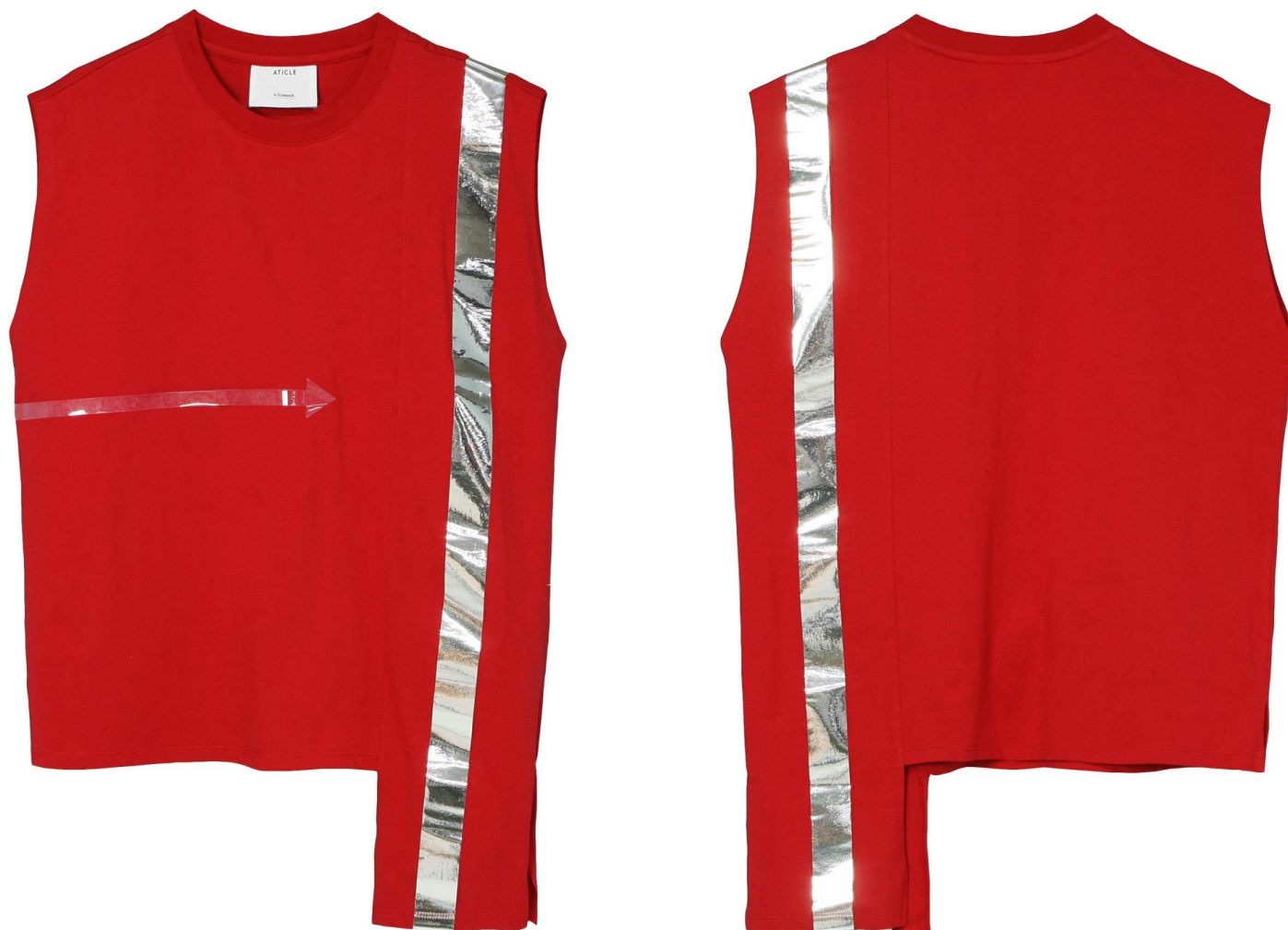
Color Block Sleeveless Top (Red)