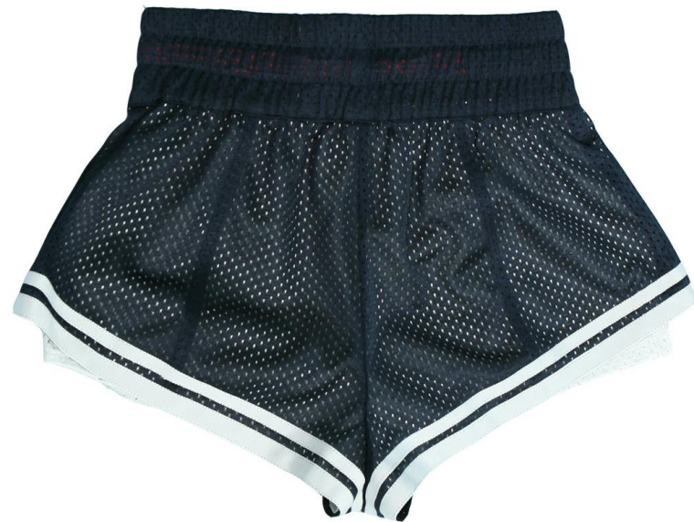
Short Distance Mesh Shorts (Navy)