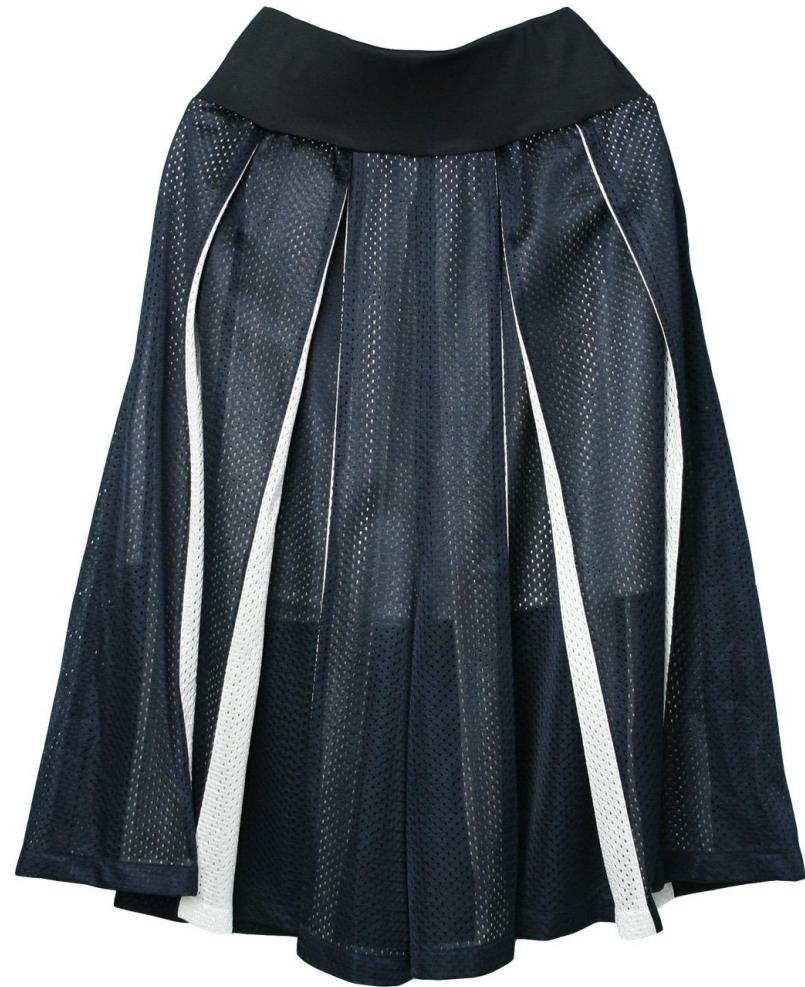
Basketball Mesh Pants (Navy)