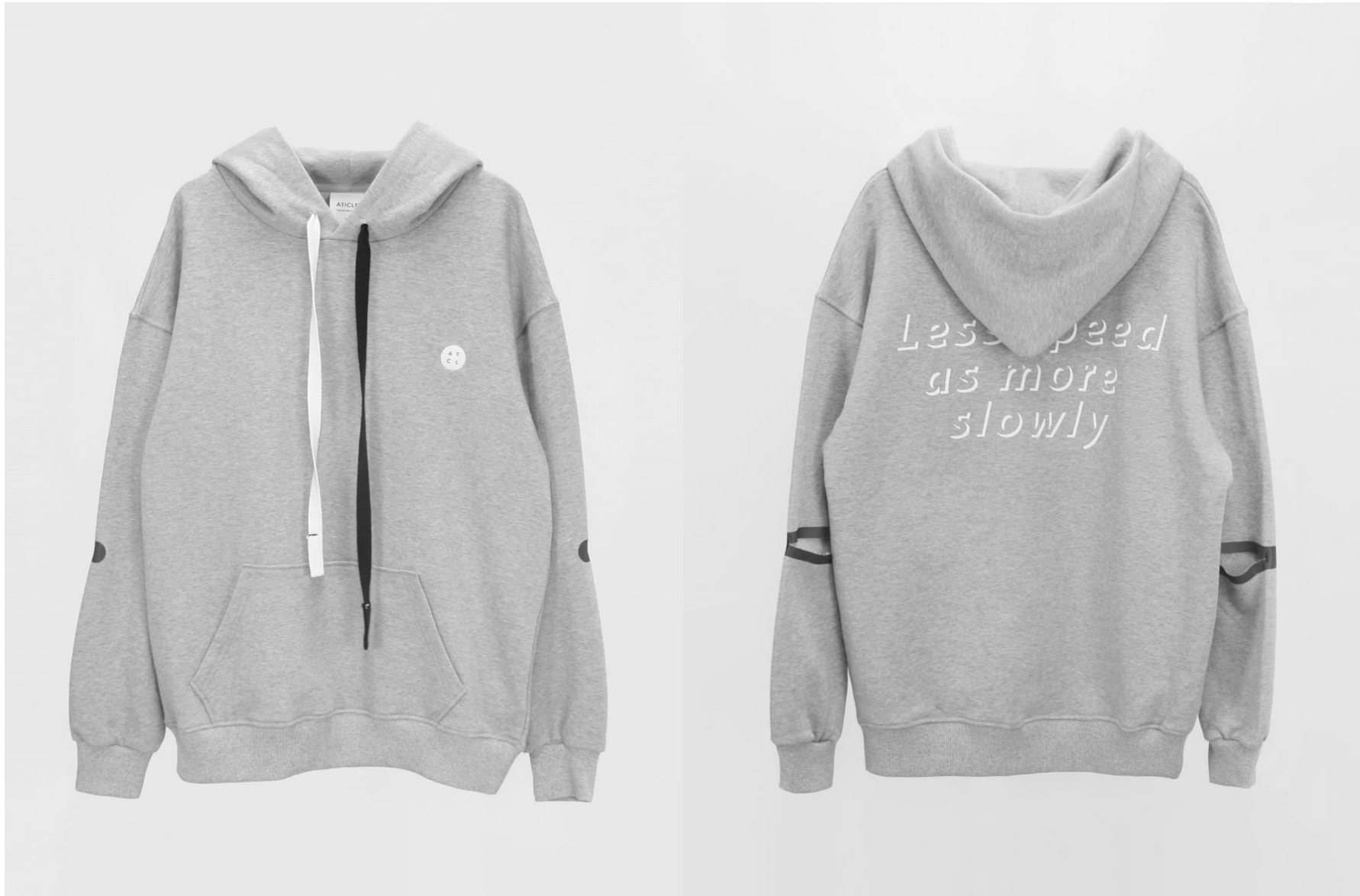
Elbow Point Hoodie Sweatshirt (Melange grey)