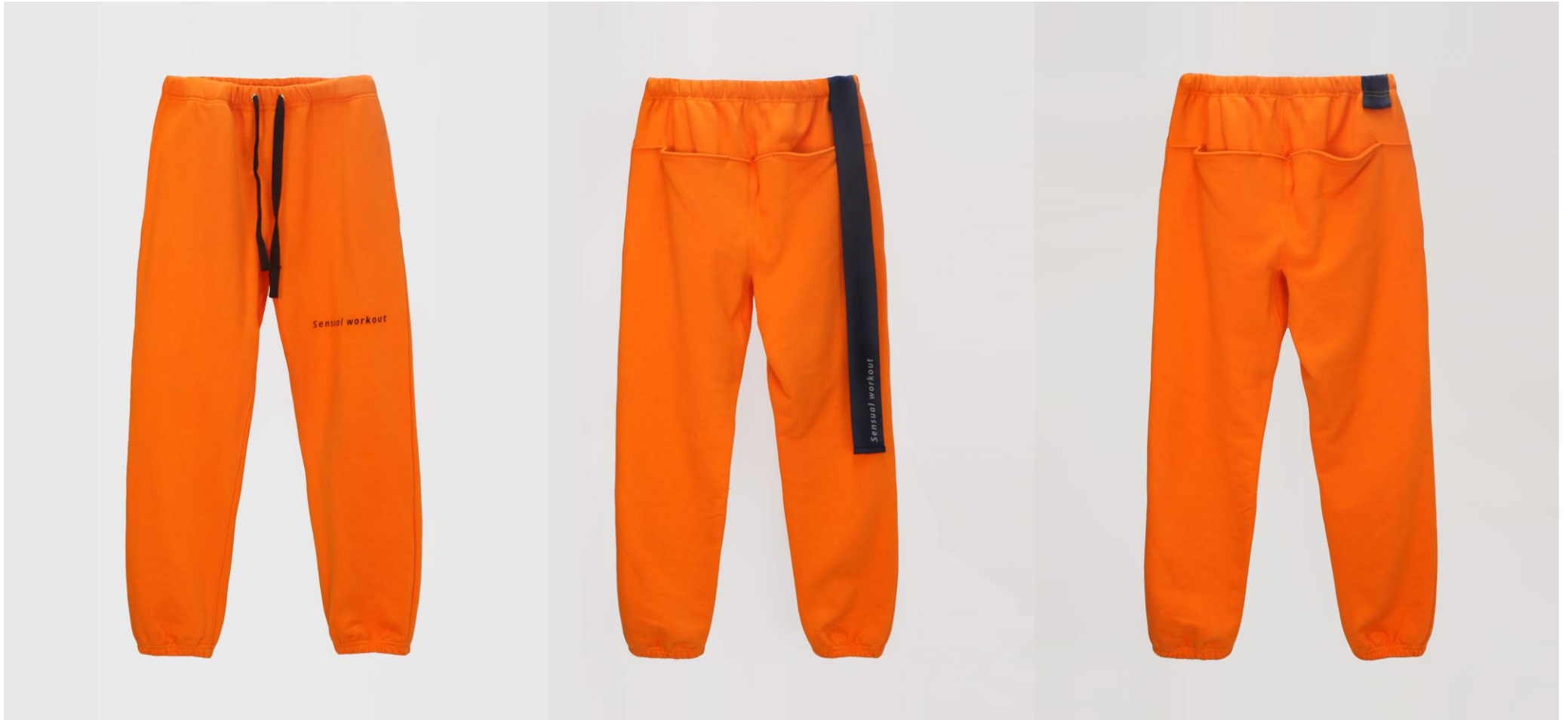
Ribbon Tape Point Basic Sweatpants (Orange)