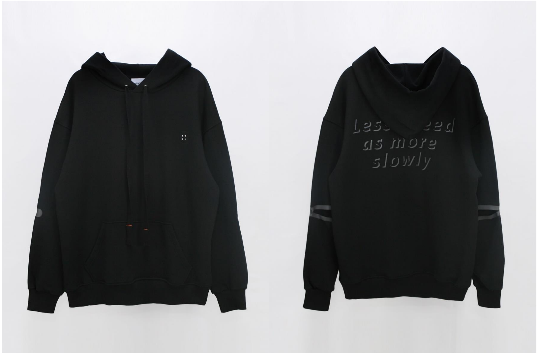
Elbow Point Hoodie Sweatshirt (Black)