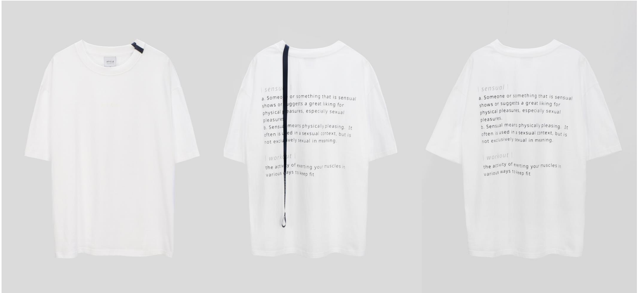
Ribbon point T-shirt (White)