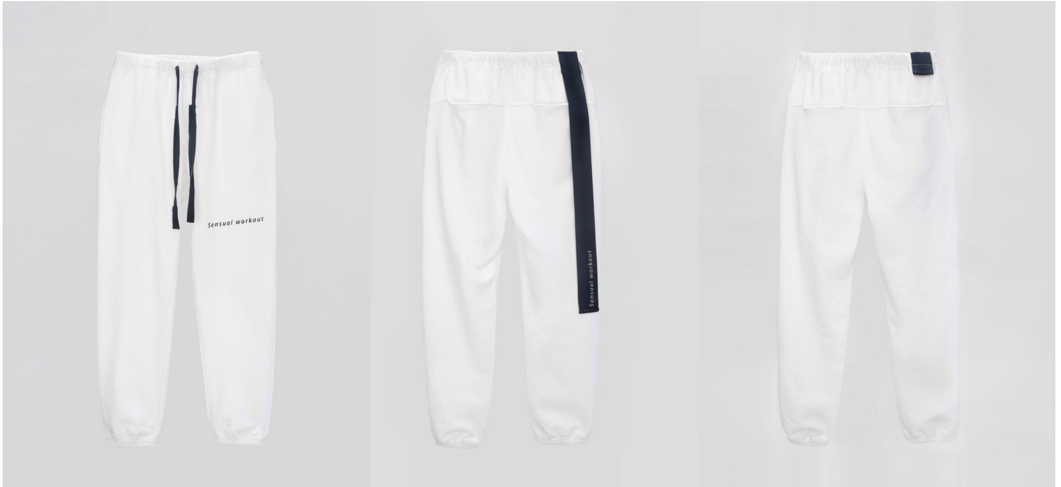
Ribbon Tape Point Basic Sweatpants (White)