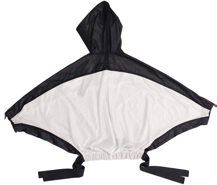
Hoody Mesh Track Blouse (Navy)