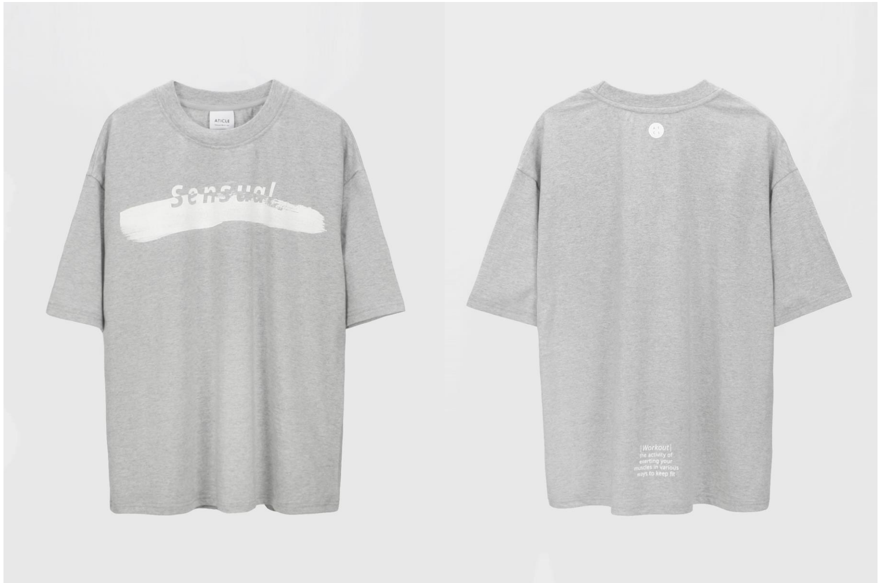
Brush Touch Print T-shirt (Melange grey)