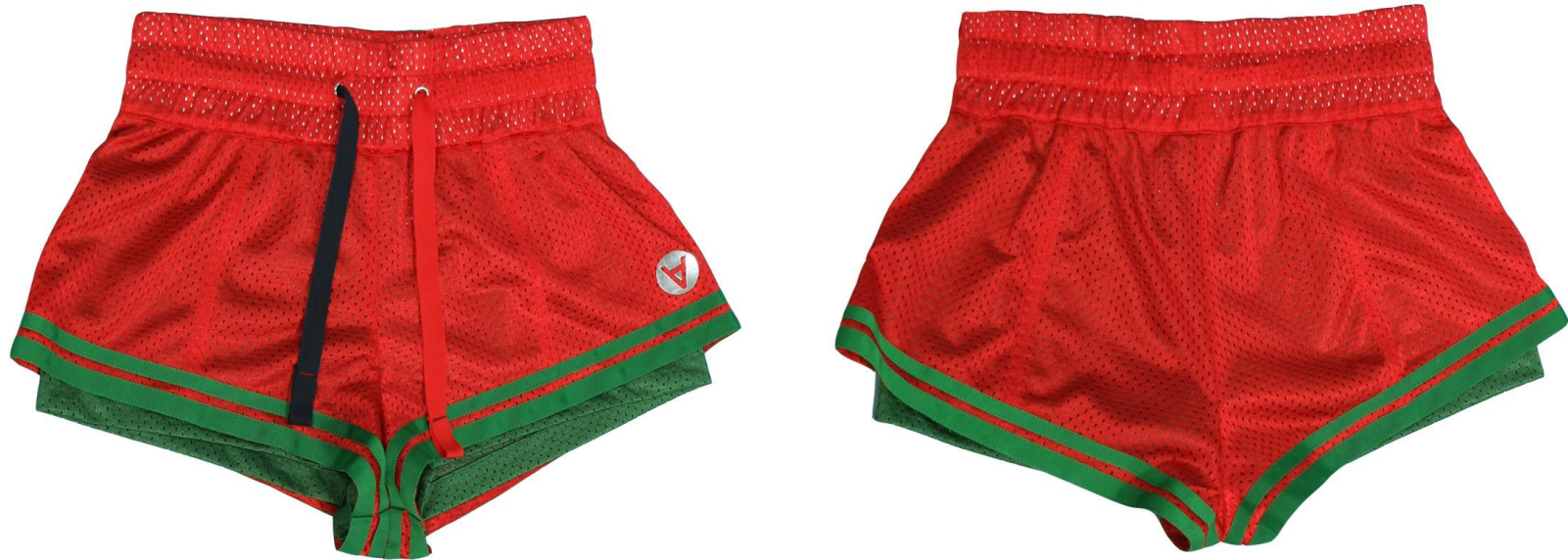
Short Distance Mesh Shorts (Red)