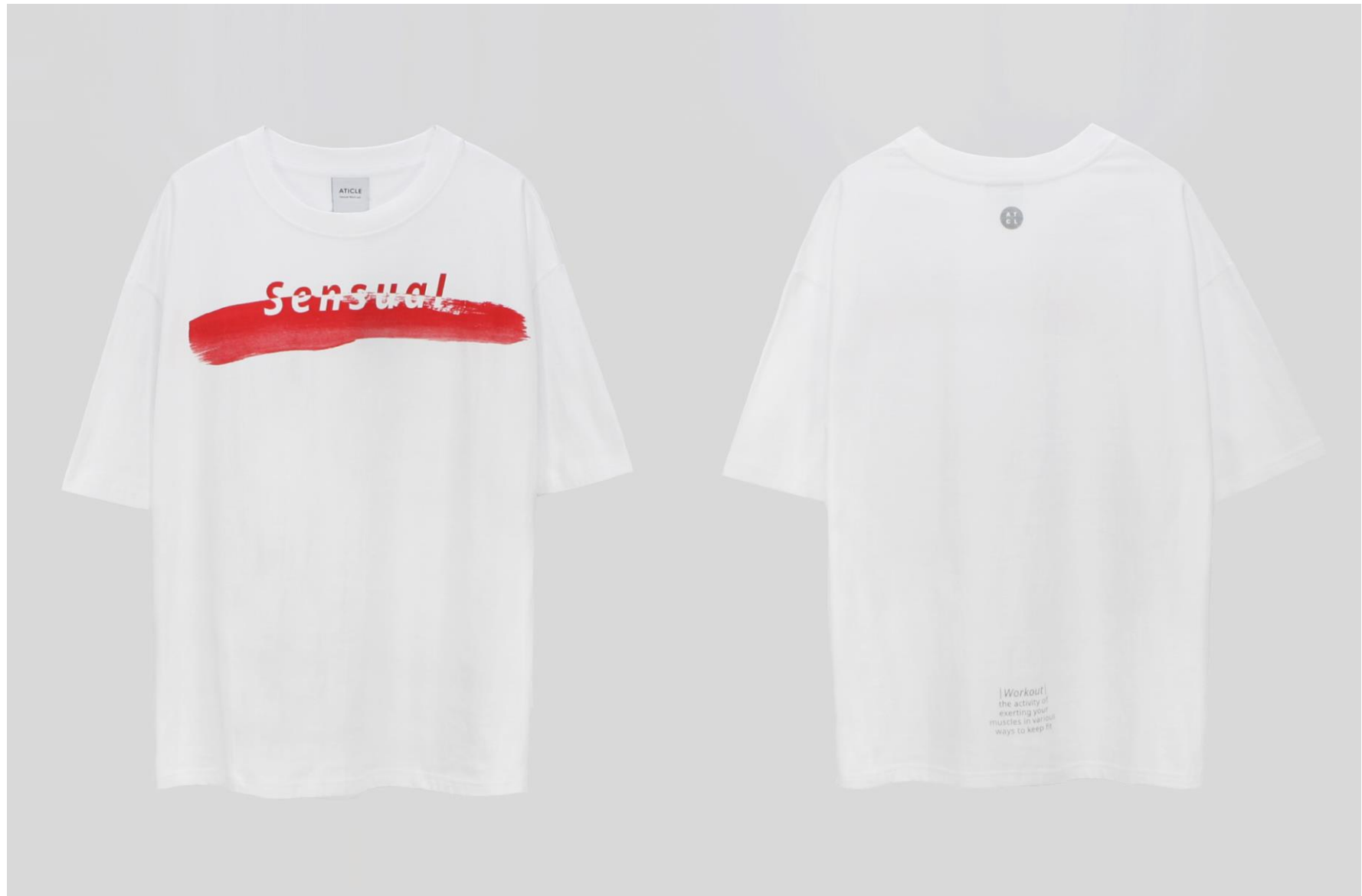
Brush Touch Print T-shirt (White)