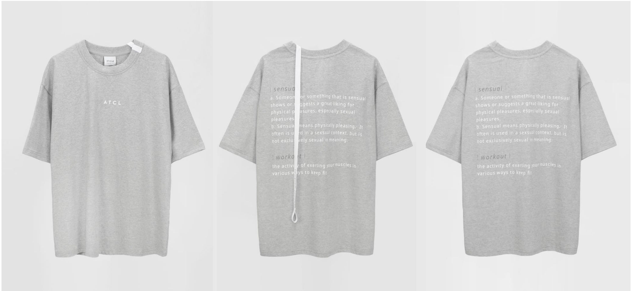
Ribbon point T-shirt (Melange grey)