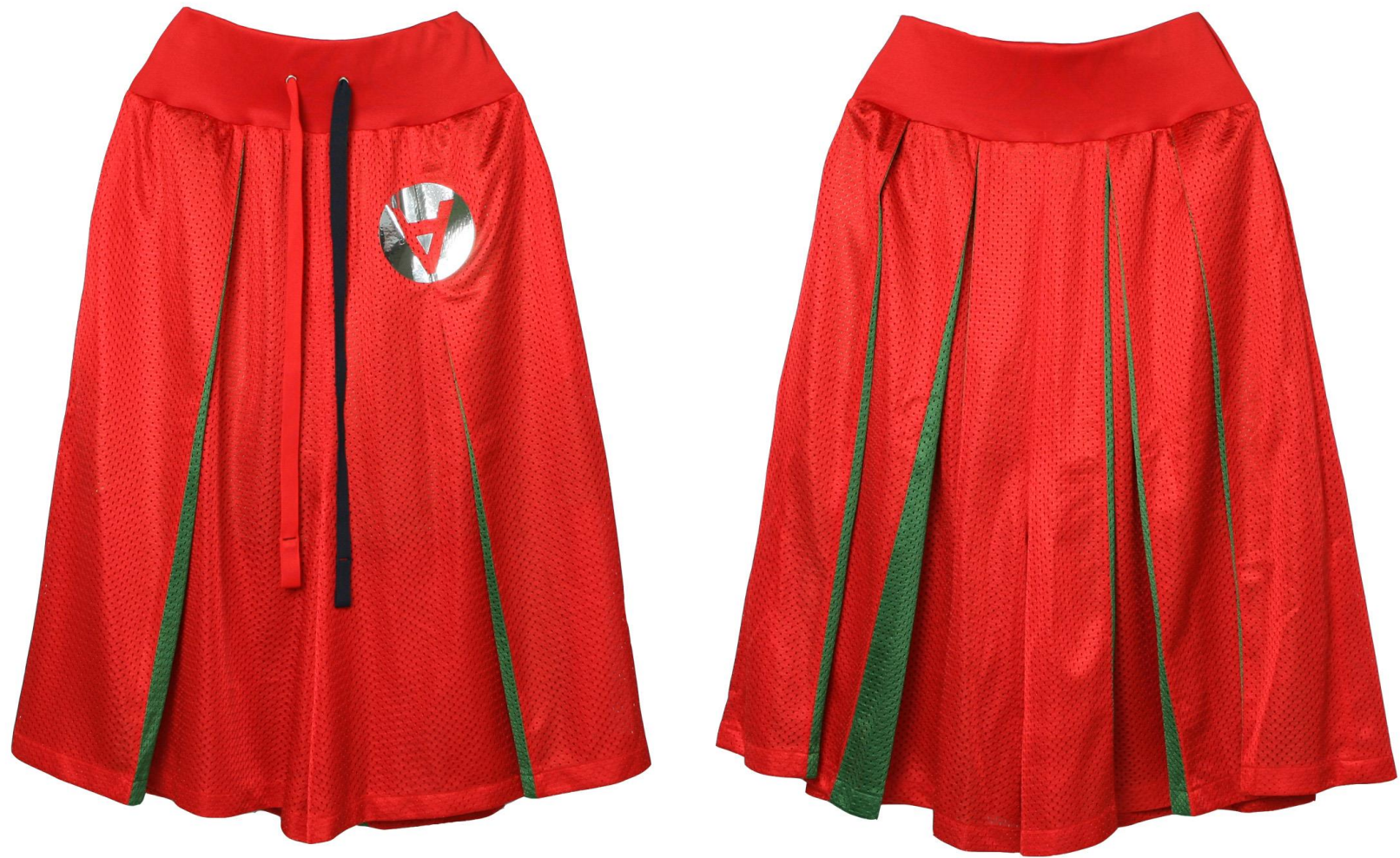
Basketball Mesh Pants (Red)