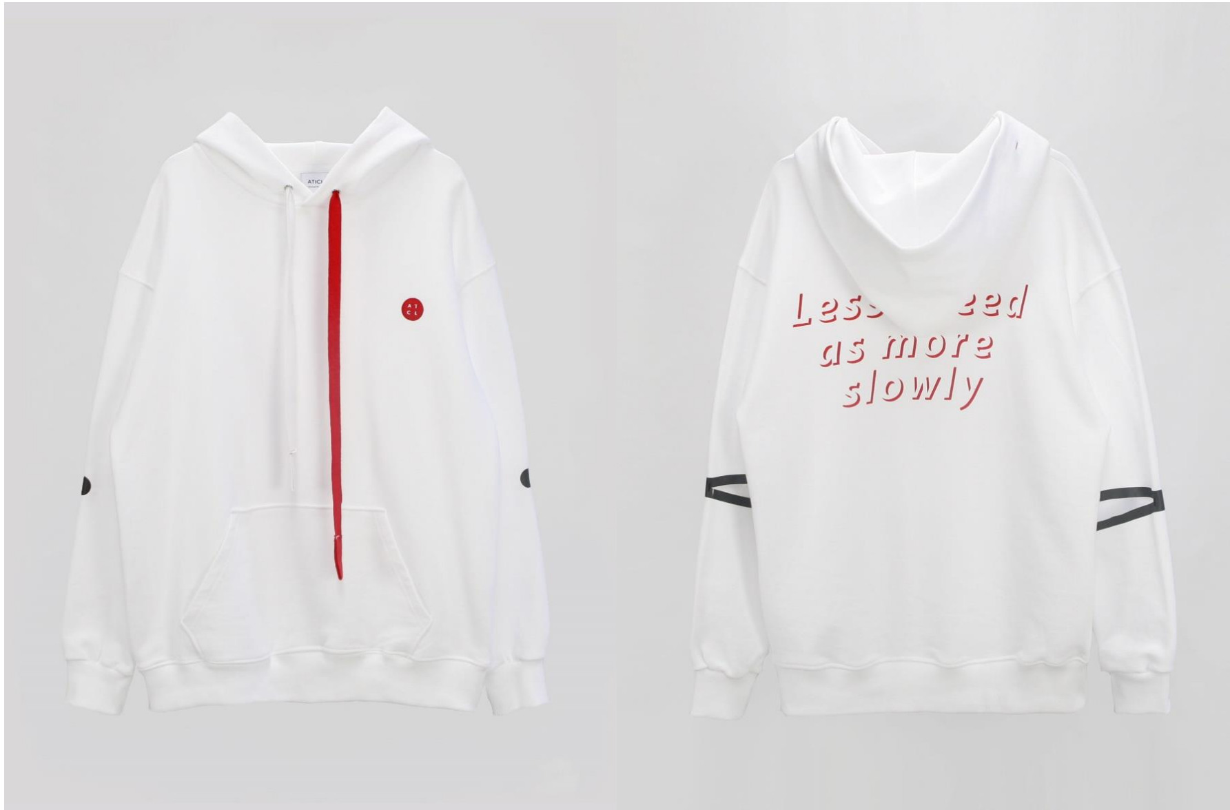
Elbow Point Hoodie Sweatshirt (White)