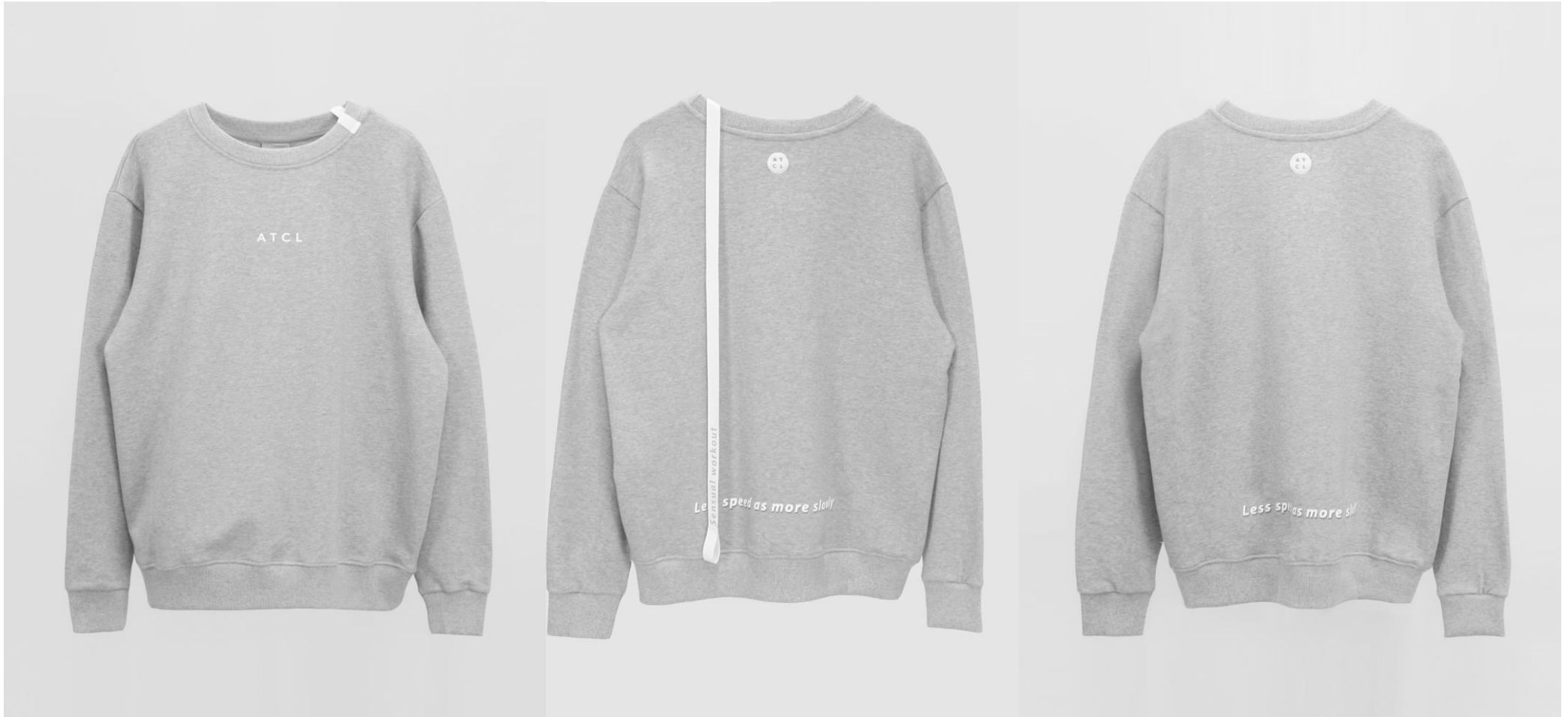
Ribbon point Basic Sweatshirt (Melange grey)