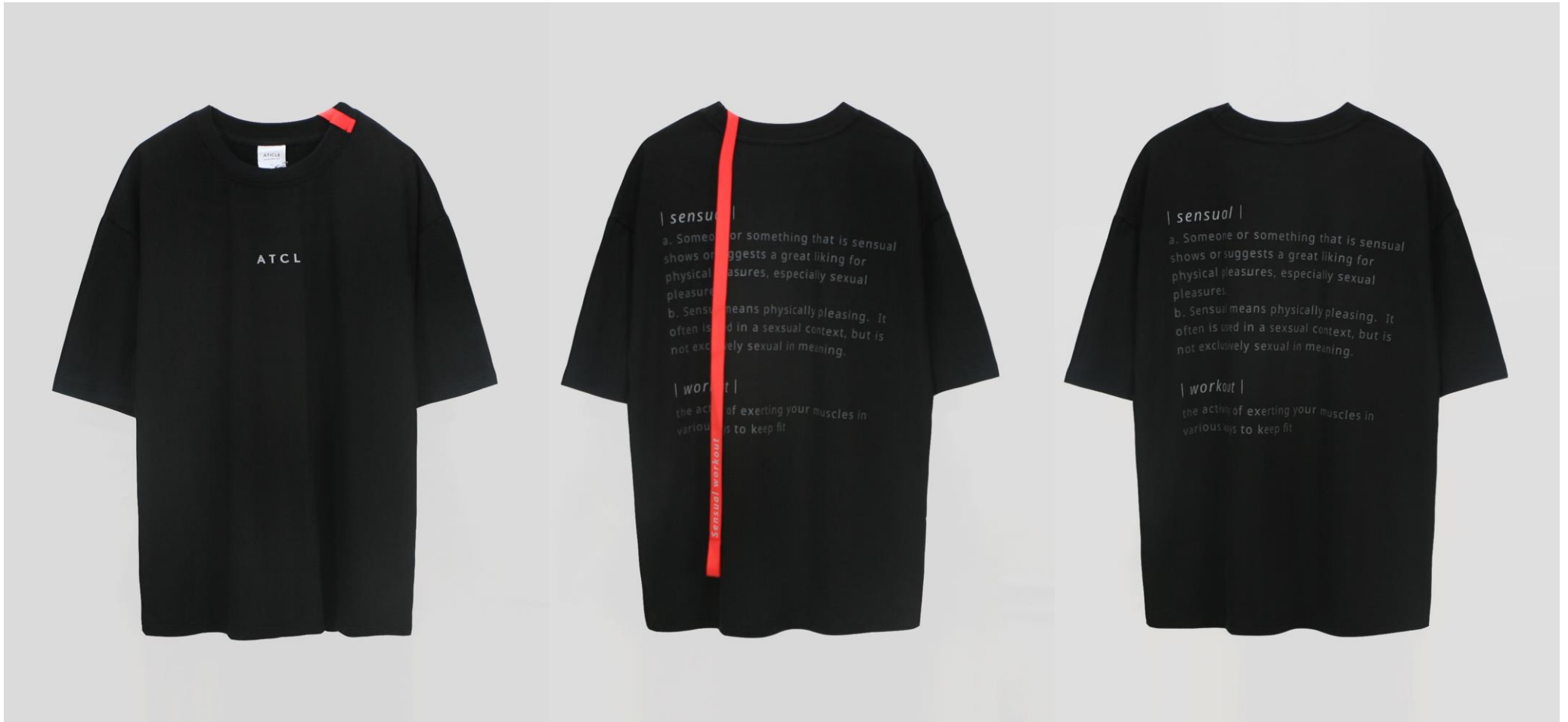
Ribbon point T-shirt (Black)