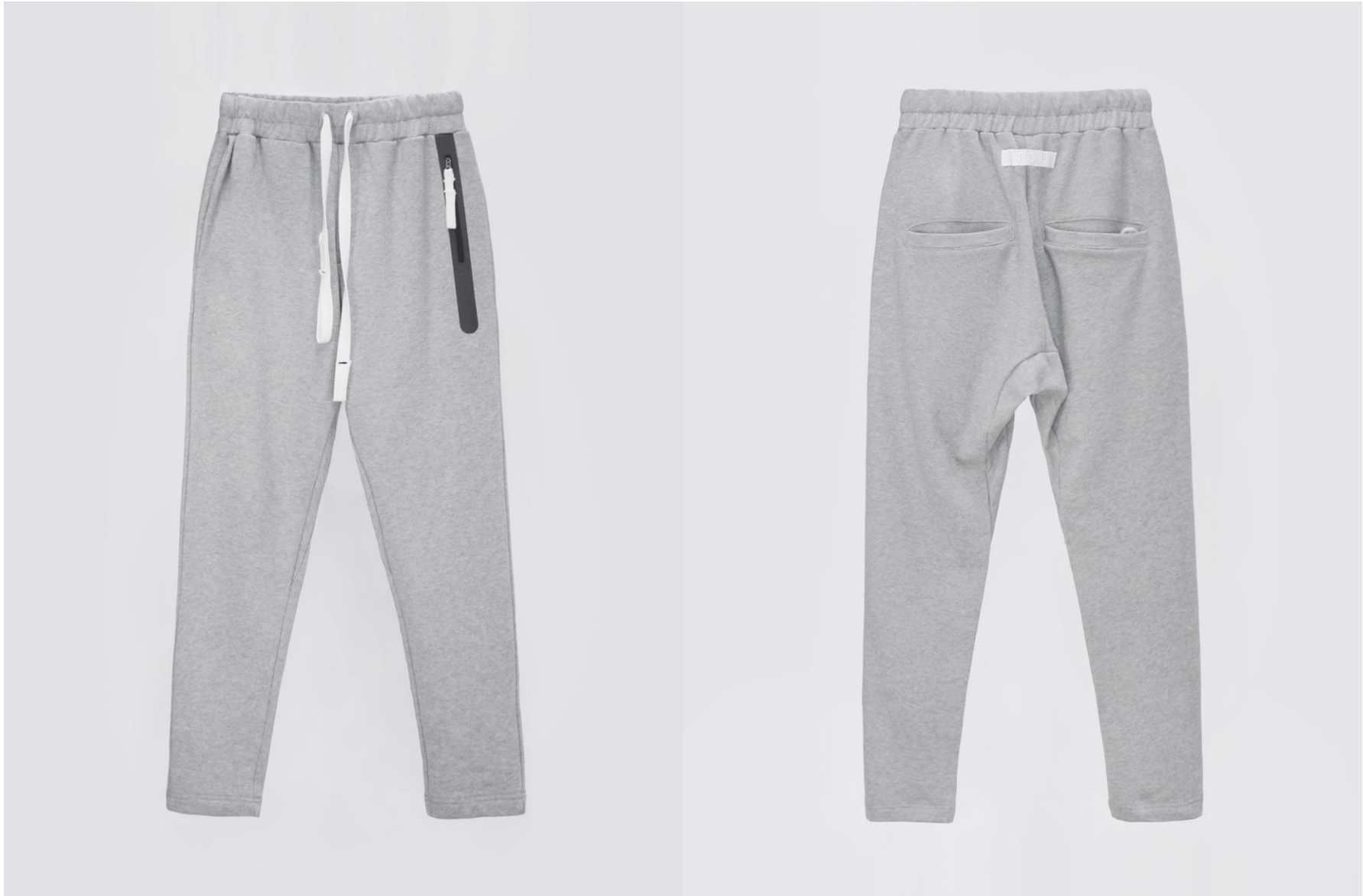
Welding Zip Baggy Fit Sweatpants (Melange grey)