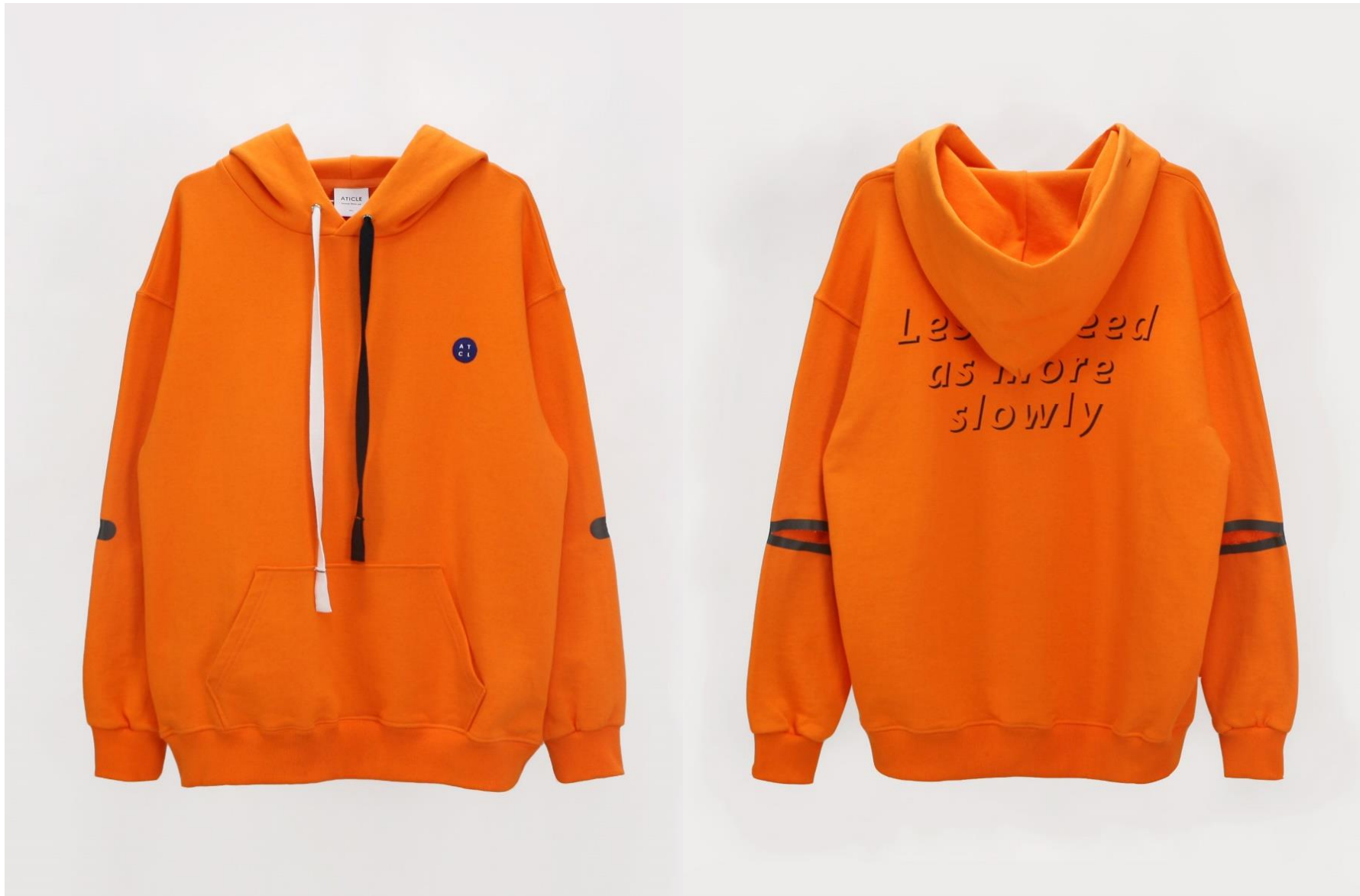
Elbow Point Hoodie Sweatshirt (Orange)