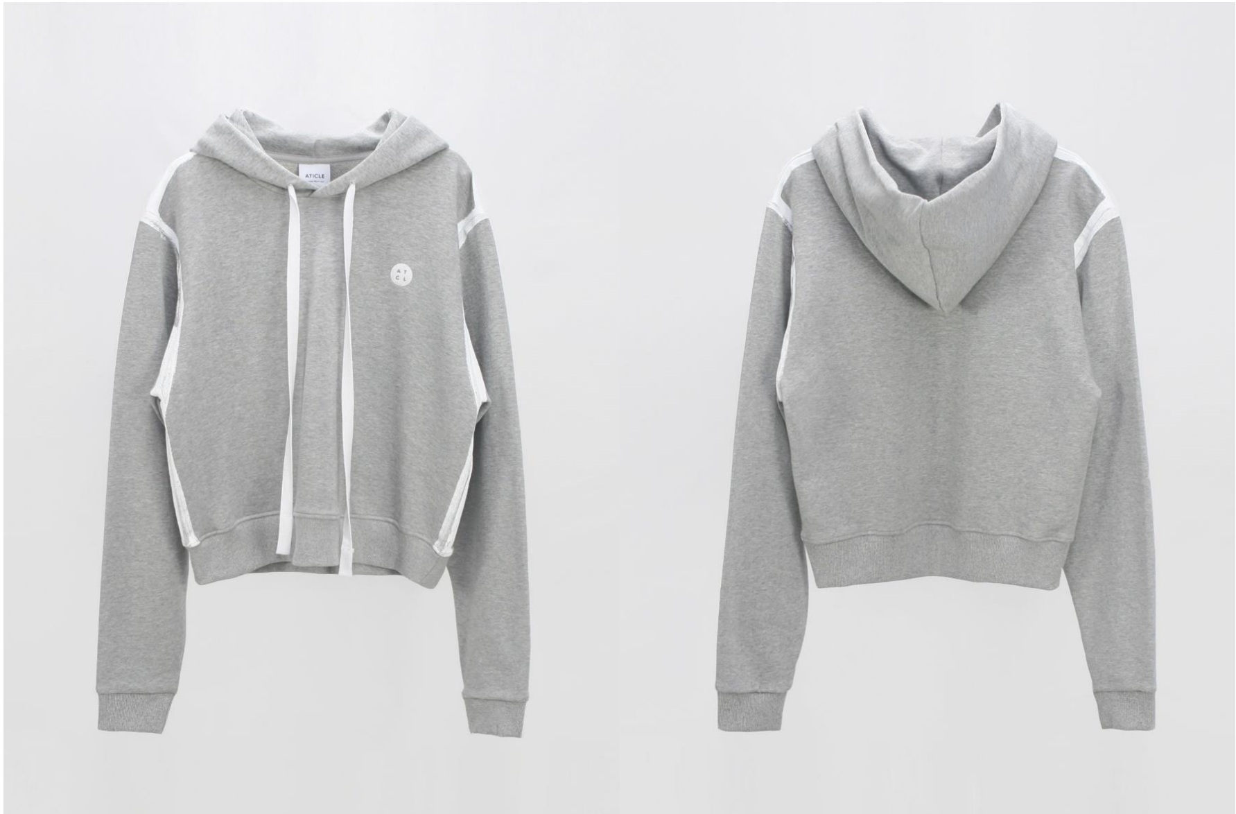
Line drawing Print Hoodie Sweatshirt (Melange grey)