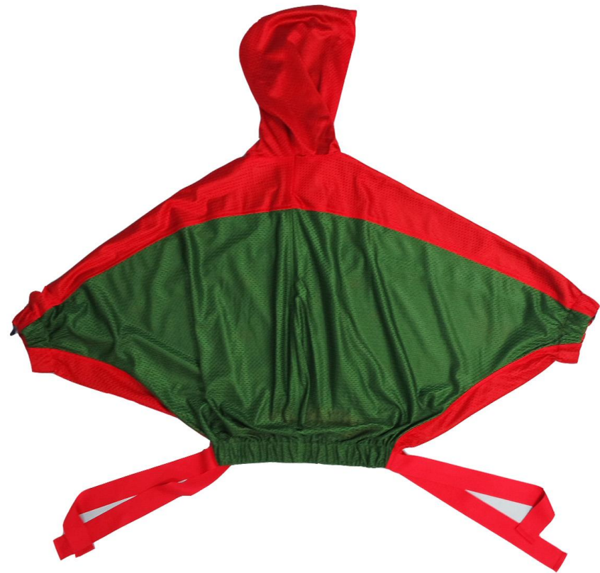
Hoody Mesh Track Blouse (Red)