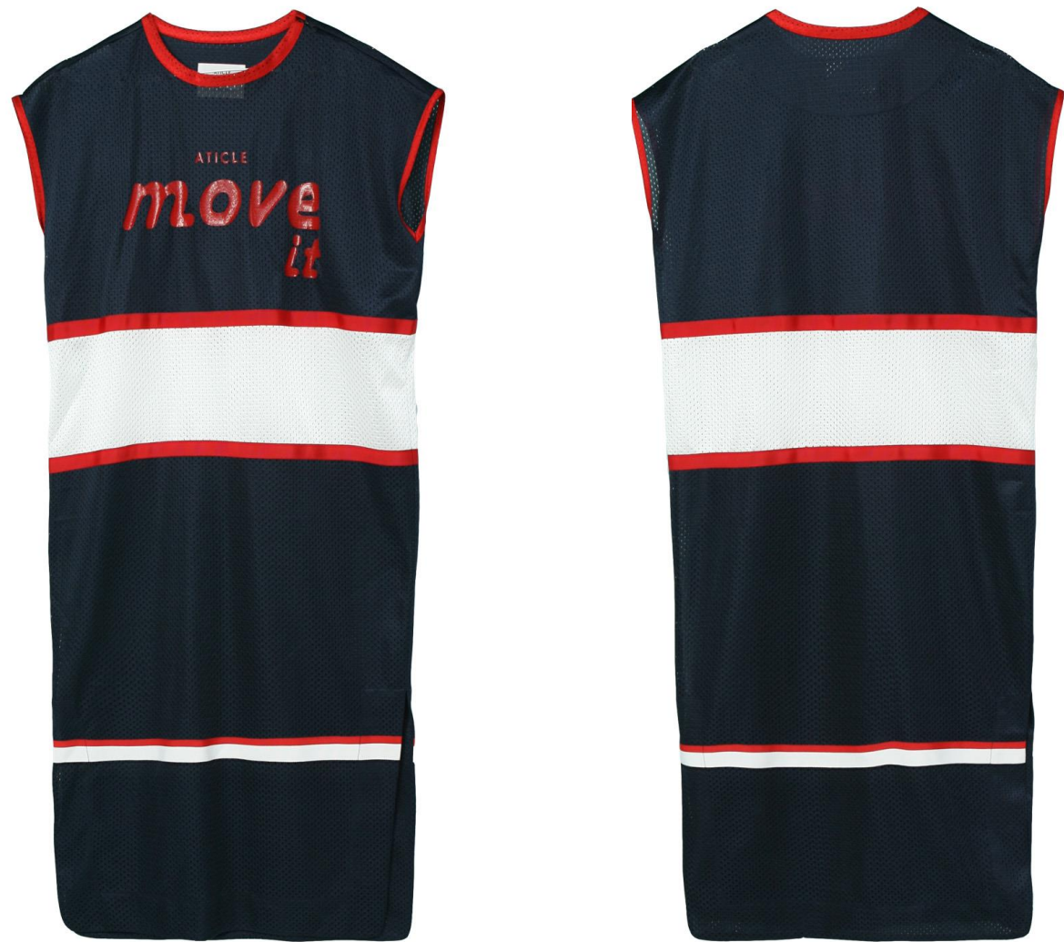
Basketball Mesh Dress (Navy)