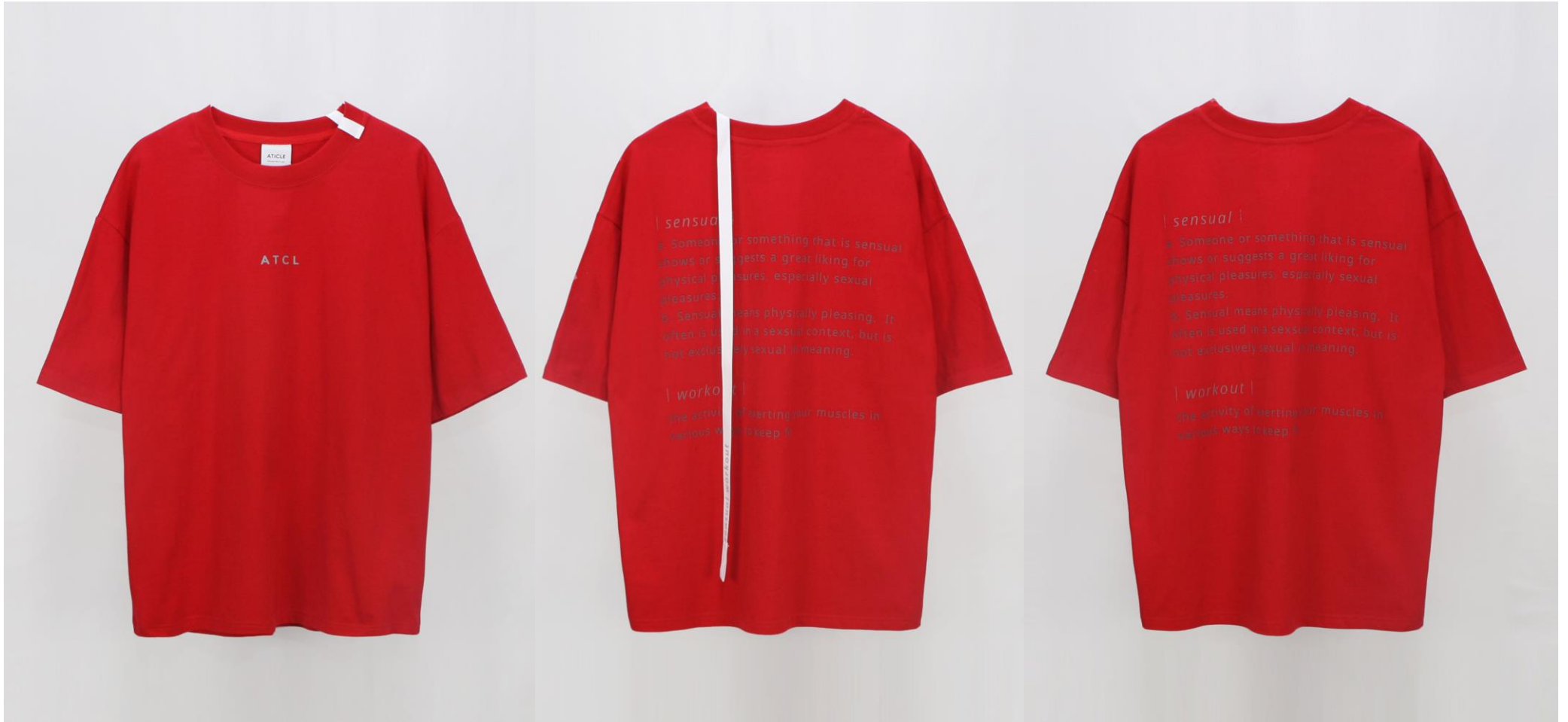
Ribbon point T-shirt (Red)