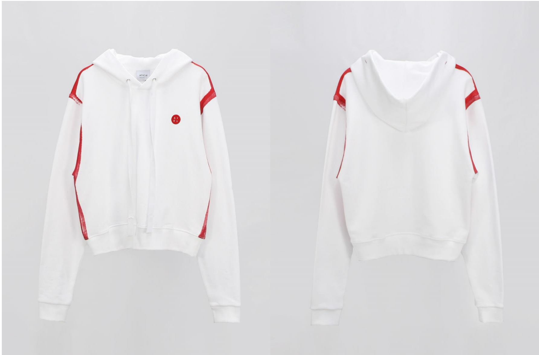
Line drawing Print Hoodie Sweatshirt (White)