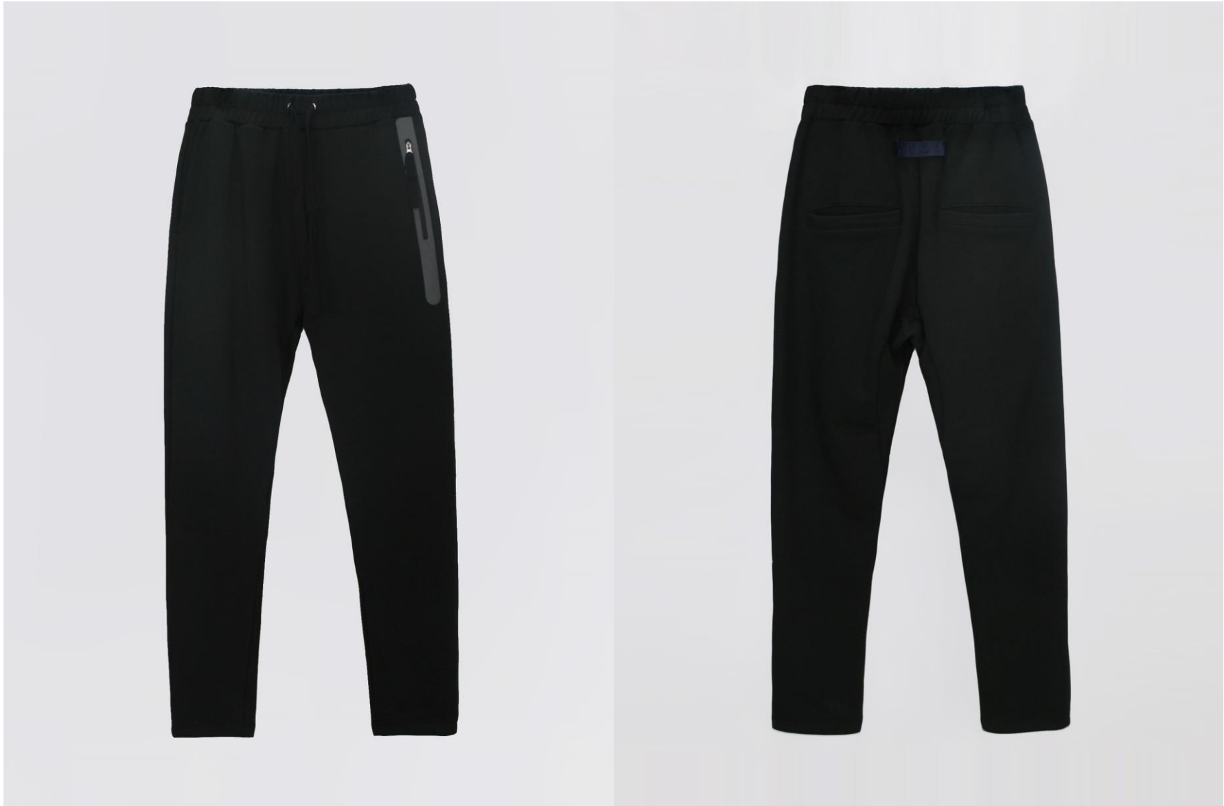
Welding Zip Baggy Fit Sweatpants (Black)