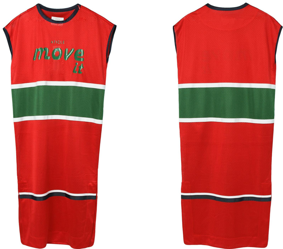
Basketball Mesh Dress (Red)