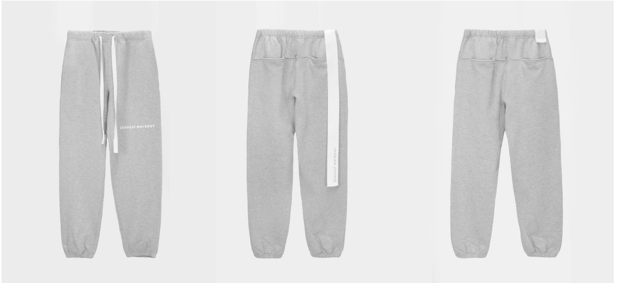
Ribbon Tape Point Basic Sweatpants (Melange grey)