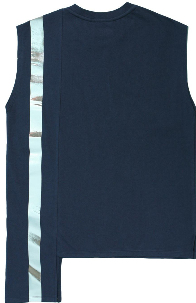
Color Block Sleeveless Top (Navy)