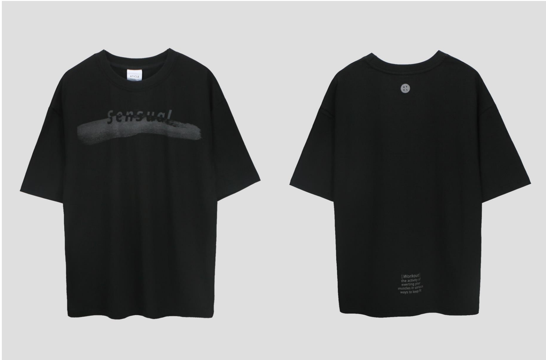
Brush Touch Print T-shirt (Black)