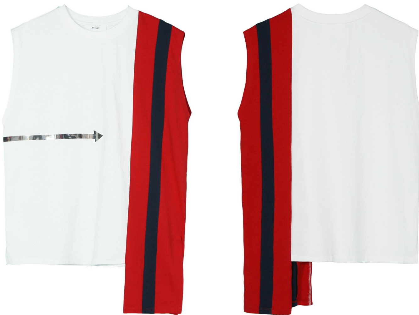
Color Block Sleeveless Top (White)