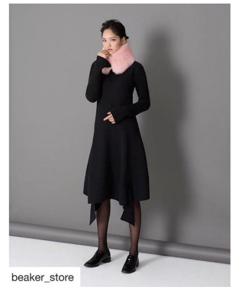
OFFICIAL HOLIDAY X TELL THE TRUTH